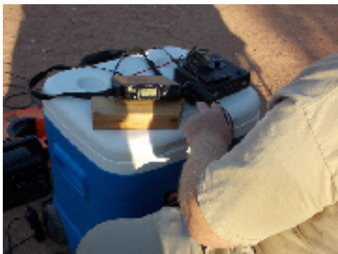
LEFT Jim WI7J and Dave K7VNH has an ice chest to carry and use as desktop. They used a easy to raise-vertical.