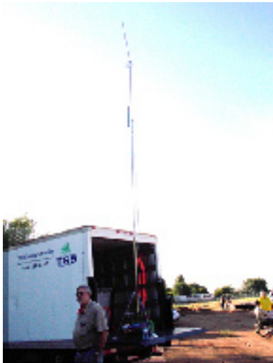
KF7YWY Cameron's truck can go almost anywhere with his 2m and 440 antennas and radio set on the tail gate plus he has built in shade.

The meeting was held west of the cemetery and east of the Bicentennial Park. The purpose was to demonstrate setting up a station in the event there was a disaster that included the lost of electric grid. The disaster could include not operating from a home station and perhaps in field conditions. We had seven different station configurations including a mobile station. The demo was very informative in the display of different types of antennas, ways of setting up an antenna, power sources and desktops.