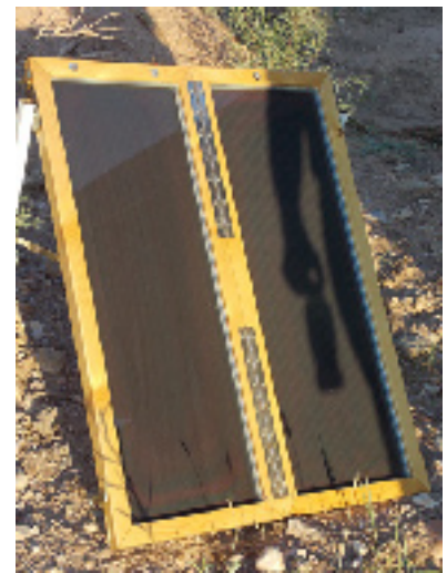
Dick's solar cell charges the motorhome battery for extensive radio activity.